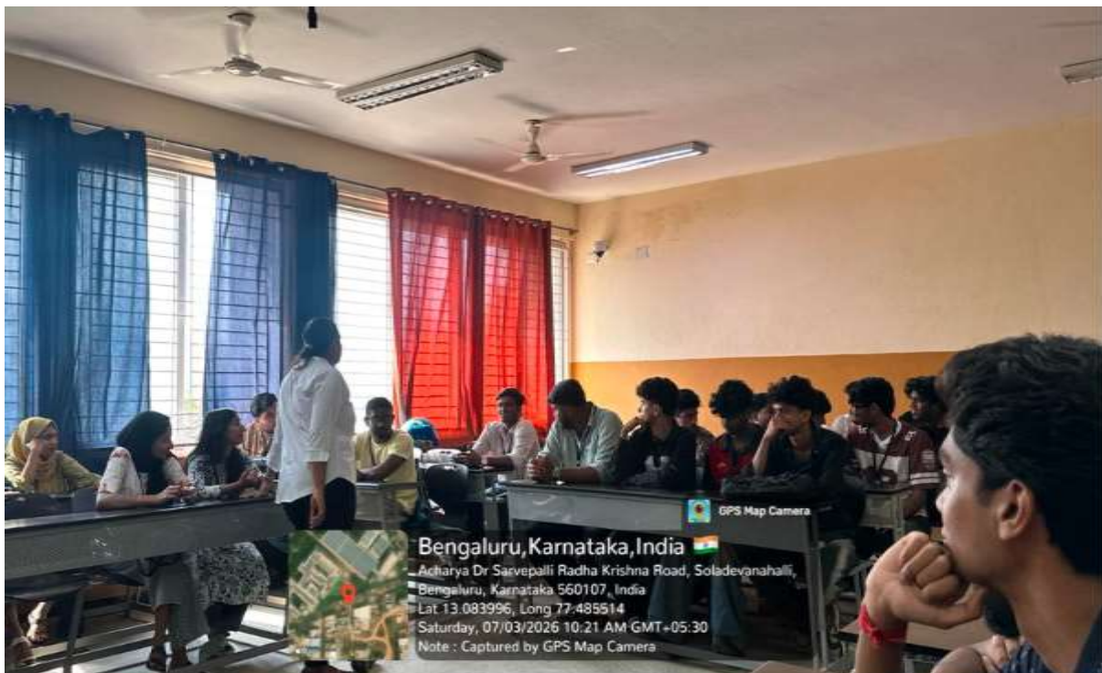
Trainer Explaining the concept.