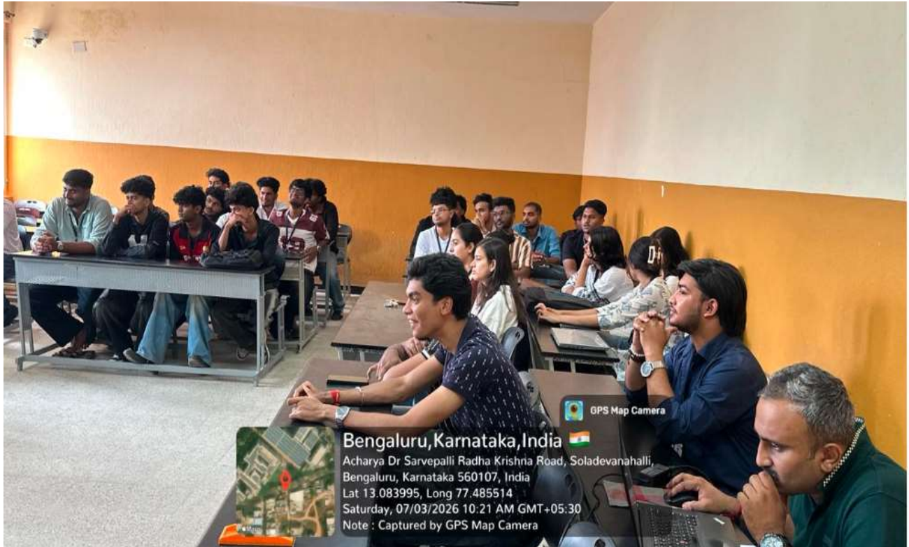
Students watching case studies .