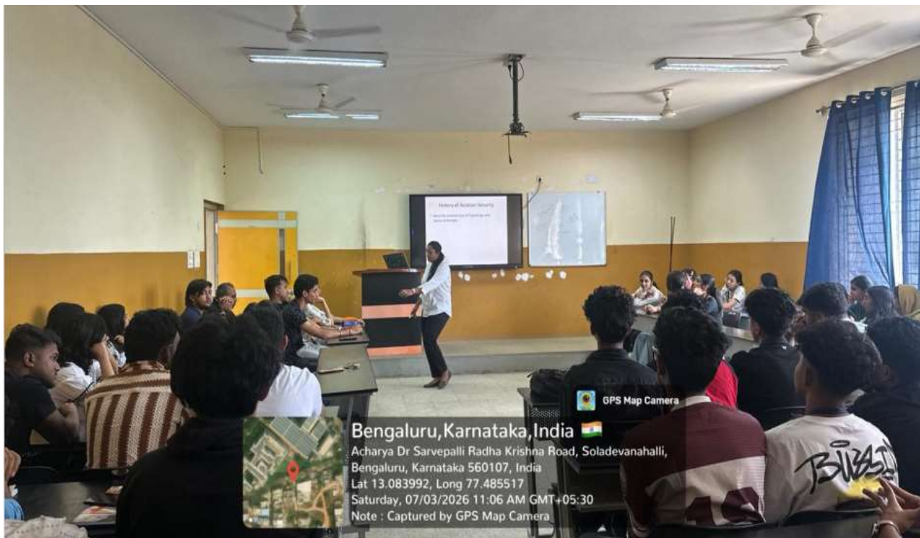
Students participating in case study demo of Aviation Incidents .