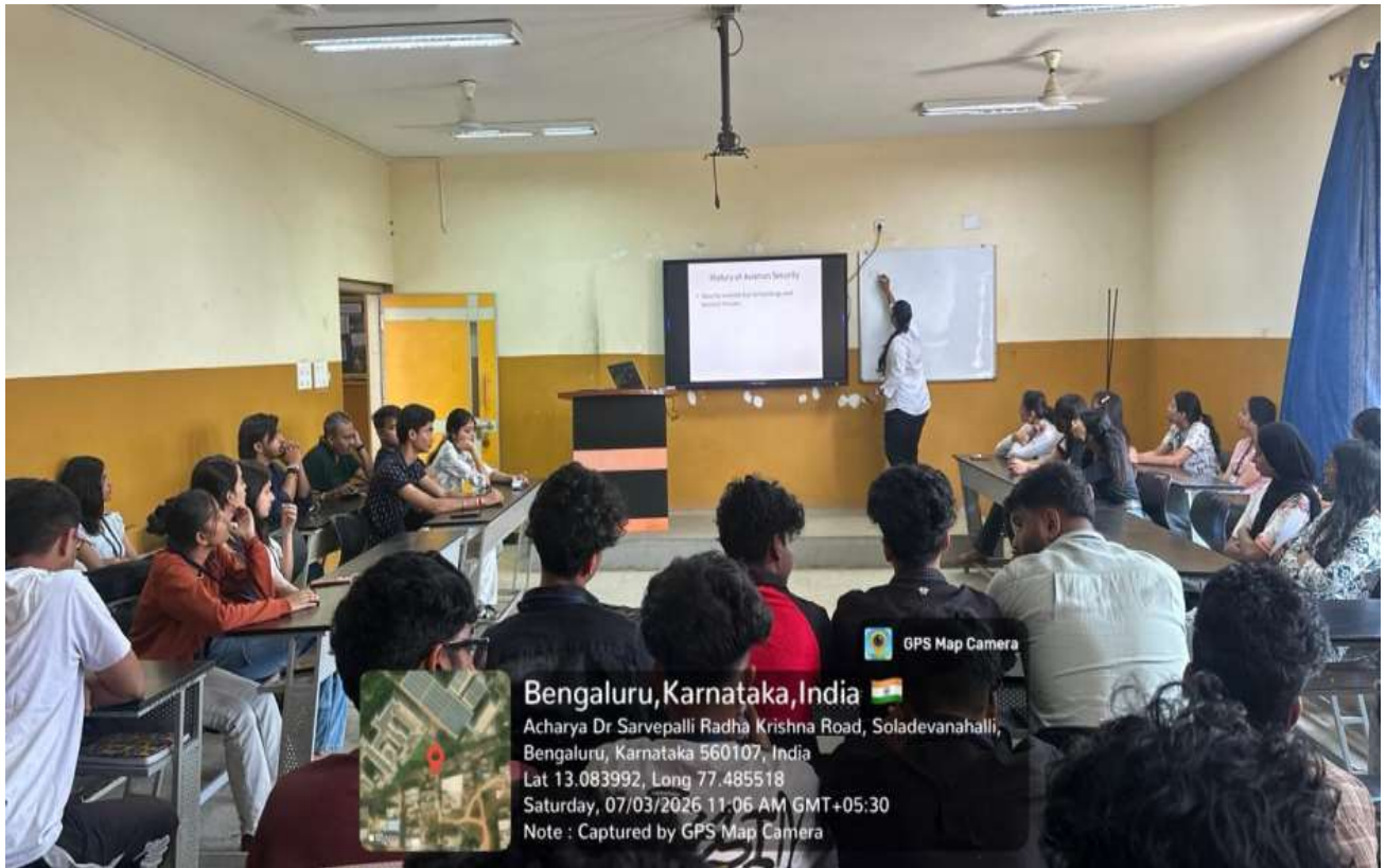
Trainer Explaining the AVSEC