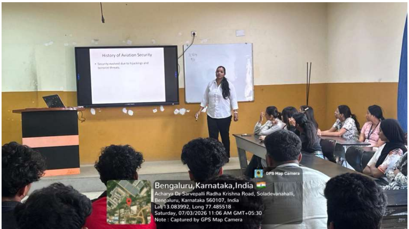
Trainer Explaining the importance of AVSEC.