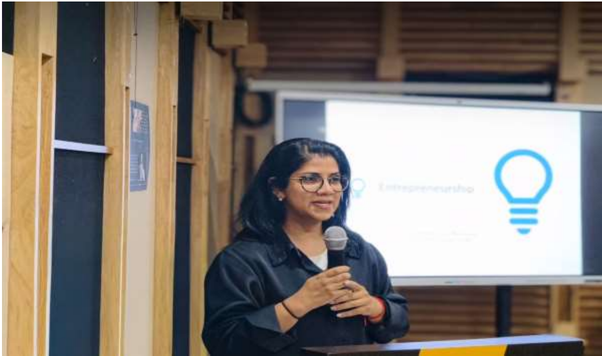
Speaker for the day delivering guest talk