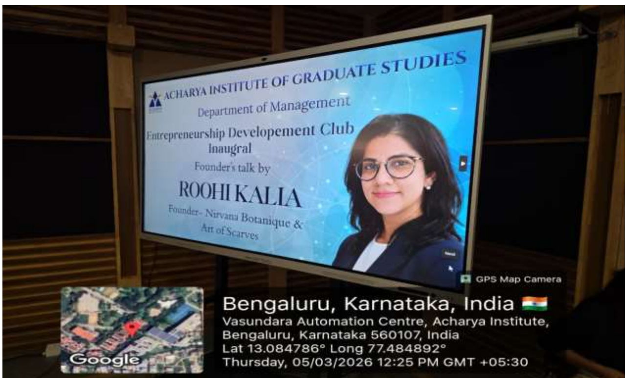
Display of the Guest Profile at the event