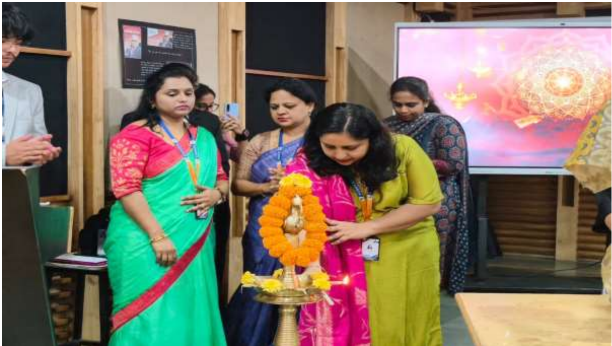
Ceremony of lighting the lamp