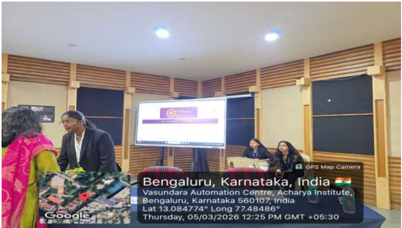
Co-ordinators at the event