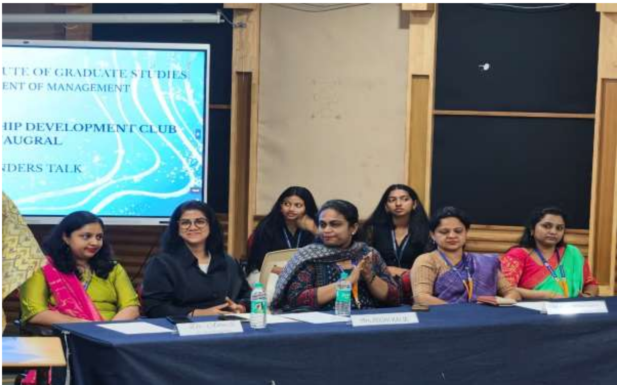
ED club teacher coordinators along with the guest speaker on the dais