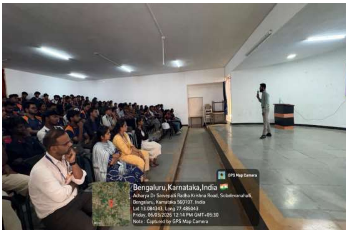
Resource Person Interacting with BCA students