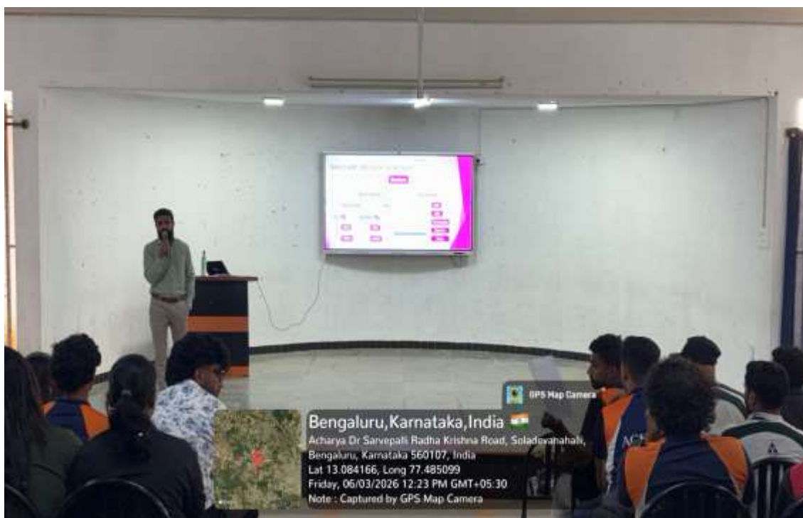
The resource person explaining the Different entrance examination for Global Education