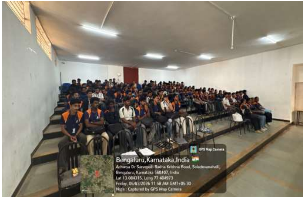
Arranging the Students for the Activity