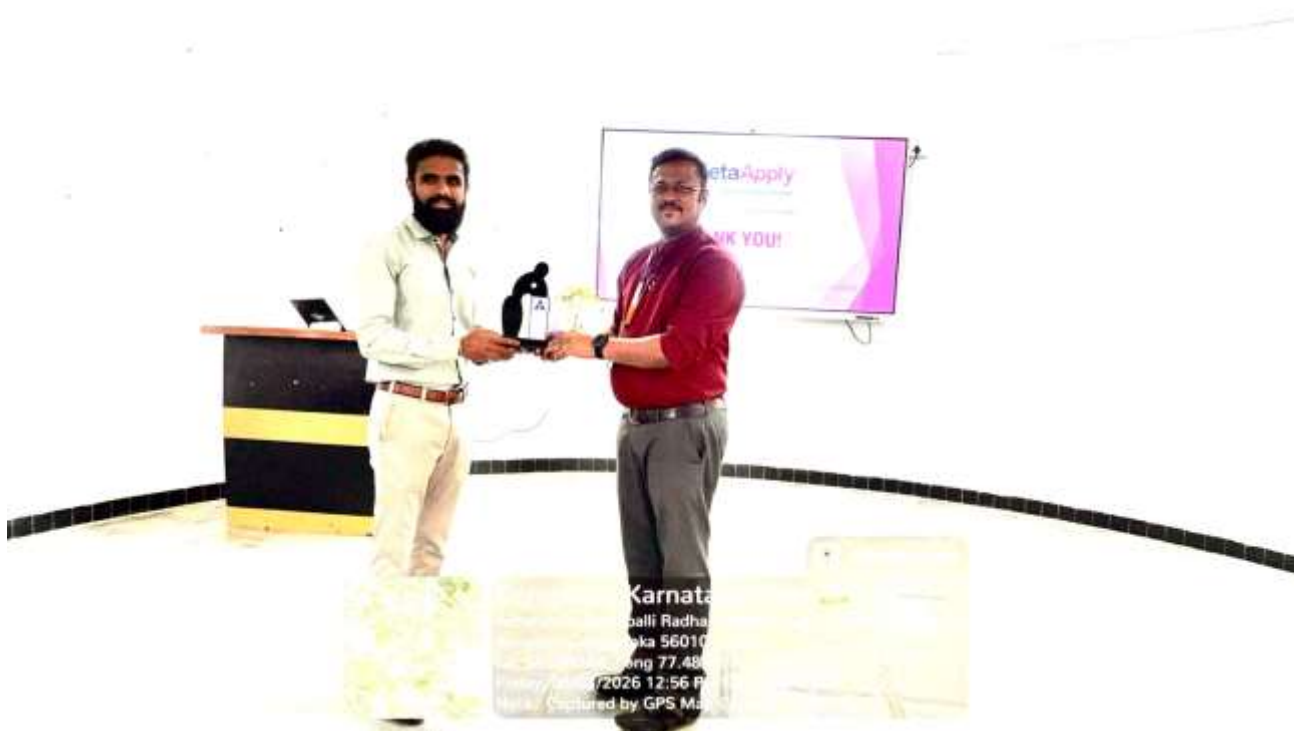
Token of graduated to the Resource person