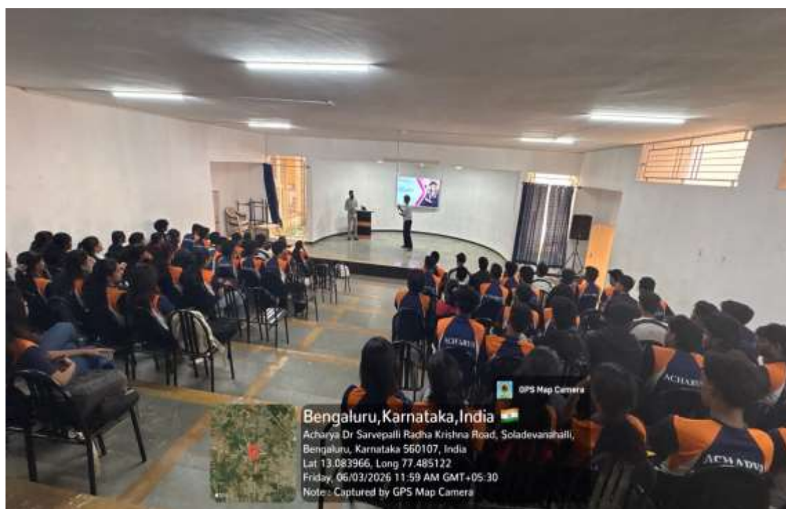
The resource person explaining the importance of Higher Education