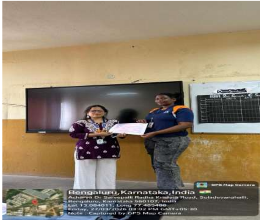
Ms Jane got second position in an activity.