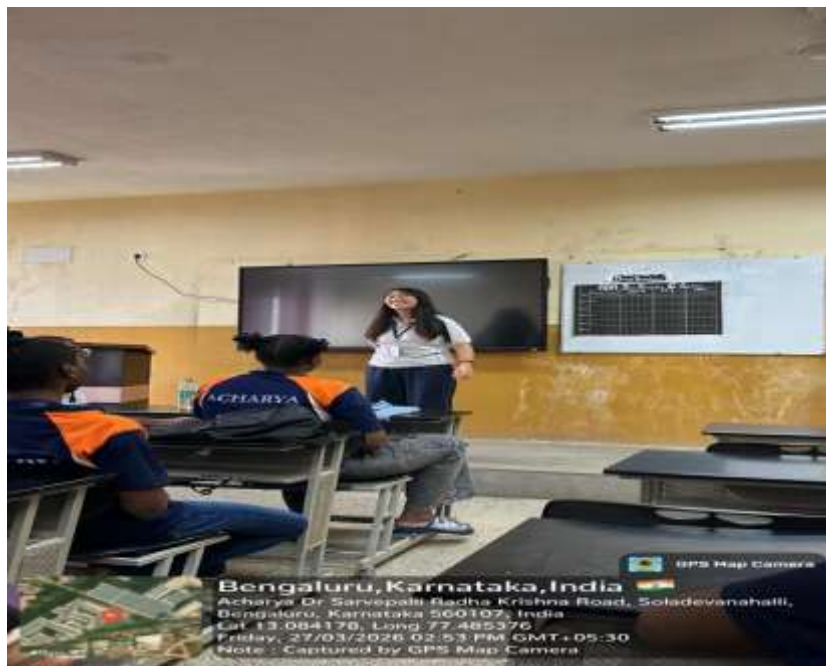
Ms. Namdol performing on stage in front of audience at the time of activity