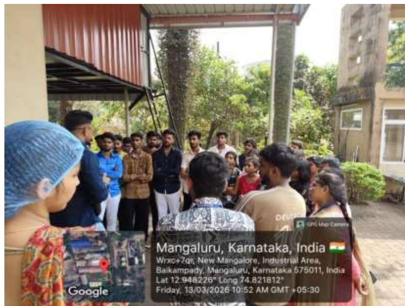
Guide briefly explaining the Production Process