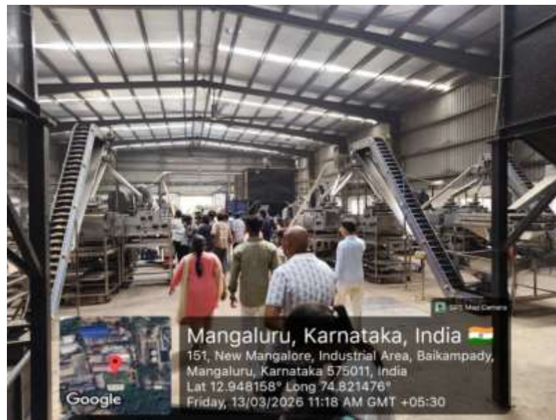
View of the Production Department