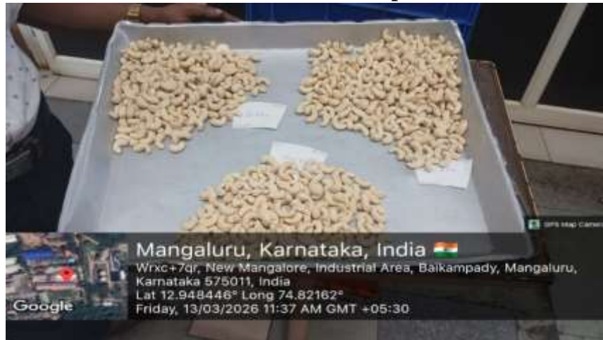
After polish and different grades of cashews