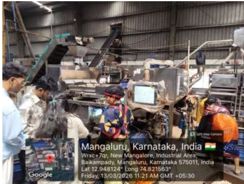
After washing the Cashew fruit the next process is segregation.