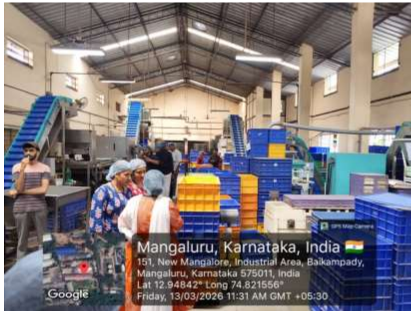
Students clarifying the doubts with guide