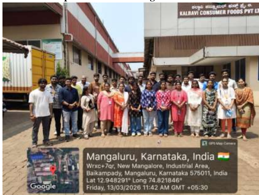
Group picture with the students and guides of the Kalbhavi Industry