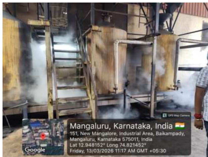
Process of washing the Cashew fruit.