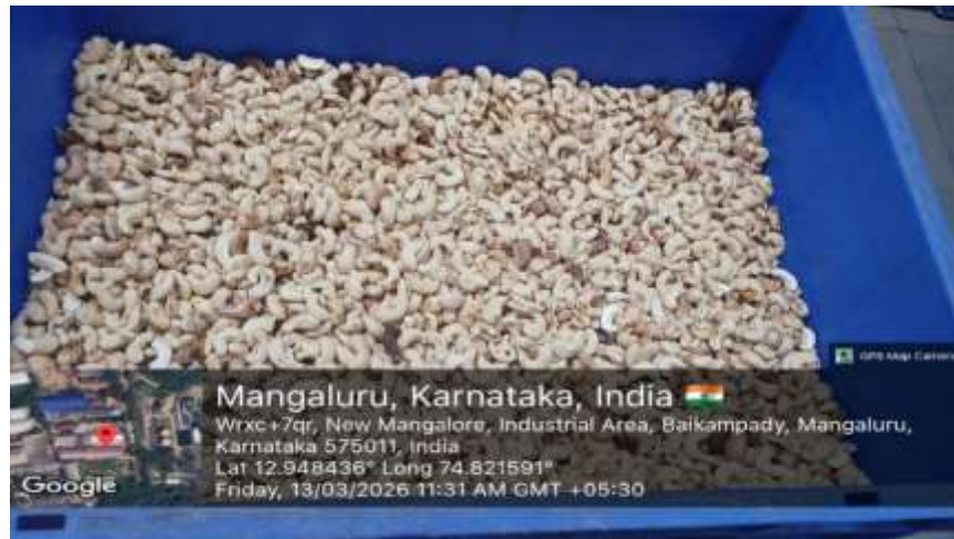
Cashew nuts before the polish.