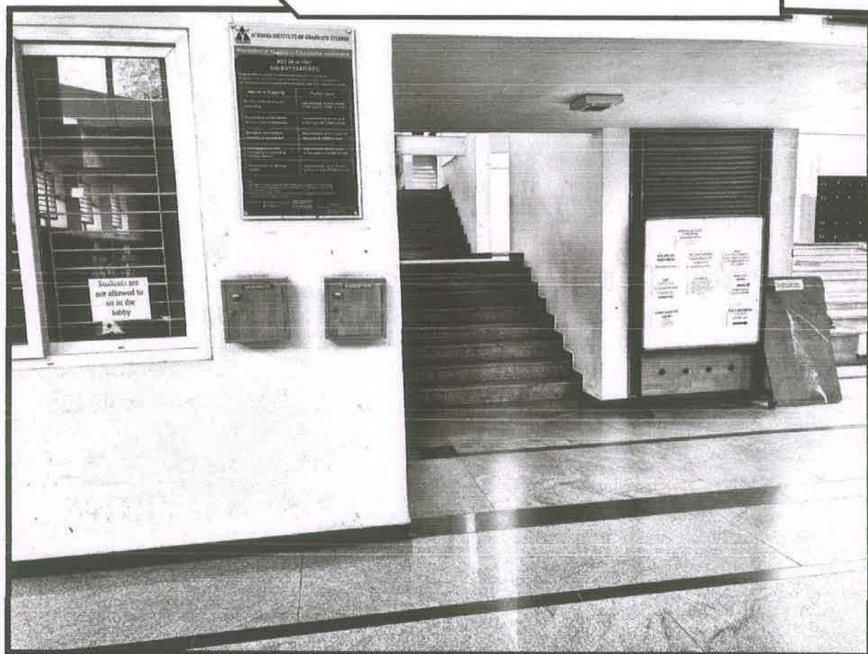
AIGS ENTRANCE LOBBY: DISPLAY OF ANTI-RAGGING SALIENT FEATURES BOARD and SUGGESTIONS and COMPLAINT BOX