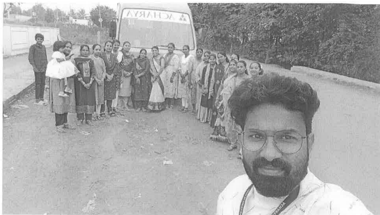
Departure from village to college campus