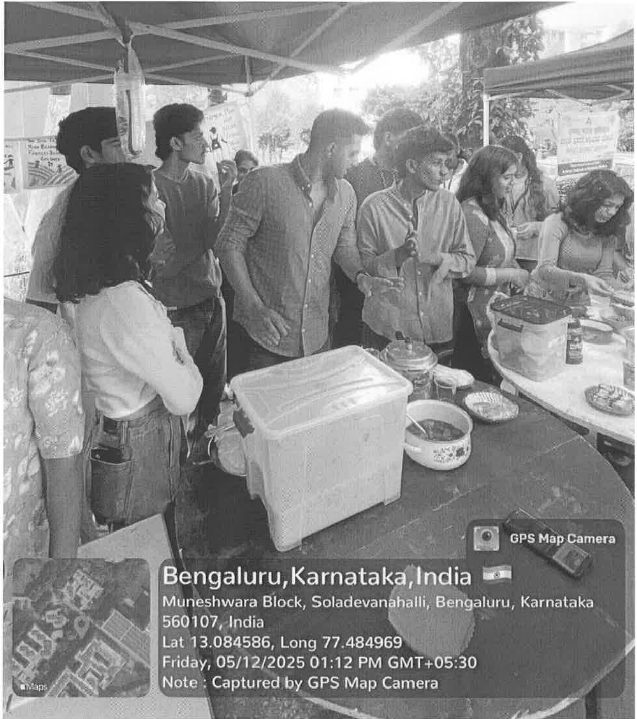
Students actively participating in the event