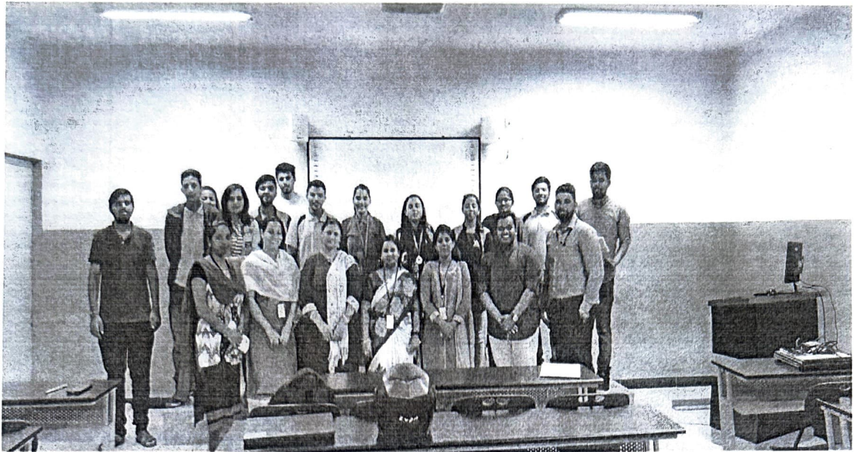
PARTICIPANTS, ORGANISERS AND JUDGES.