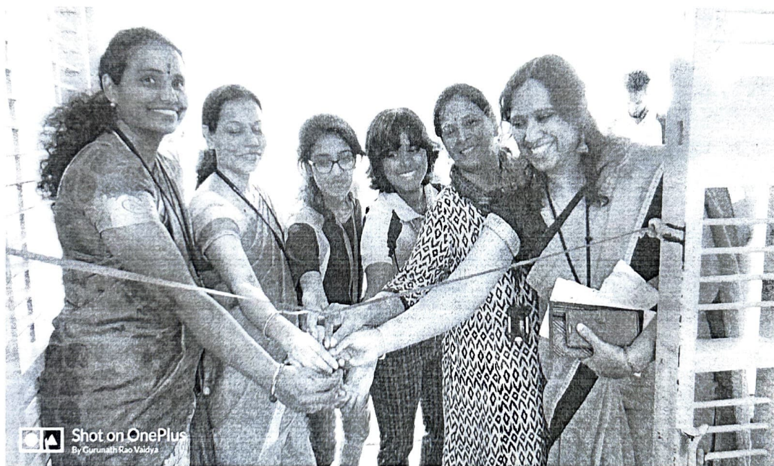
Inauguration of Women's Day Stall

AGNISHIKHA, the Women's Cell of AIGS observed International Women's Day on 8 March 2019. The womanhood was celebrated by setting a platform for the female faculty and students to exhibit their inherent talents/skills. There was an array of hand-made accessories, craft works, demonstration of Mehendi designs that treated the eyes and food stalls that soothed the tongue. The stalls and designs were visited by students and faculty in good numbers. It was followed by the cultural programmes wherein the students performed classical dance, recited poetry and sang songs celebrating womanhood. The day swayed in the celebration mode. The student and faculty fraternity expressed their happiness for the observance of the day that prided their existence.